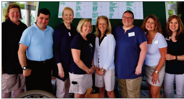
The staff and volunteers pose for a shot on June 10th!