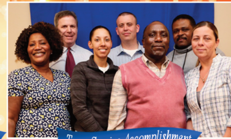
Team Service Accomplishment The Earl Avenue Group Home staff received the Team Service Accomplishment Award