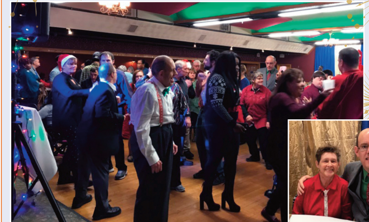
A crowded dance floor!